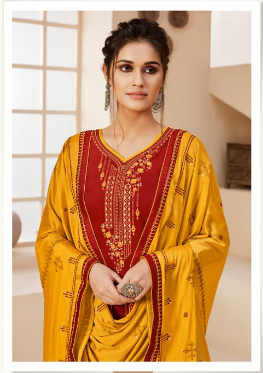
1631 Essence of royal