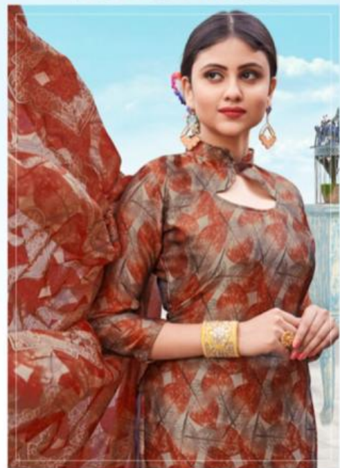
The shiny golden embroidered border modifies the fashion aesthetics and gives you shine D.NO-2009