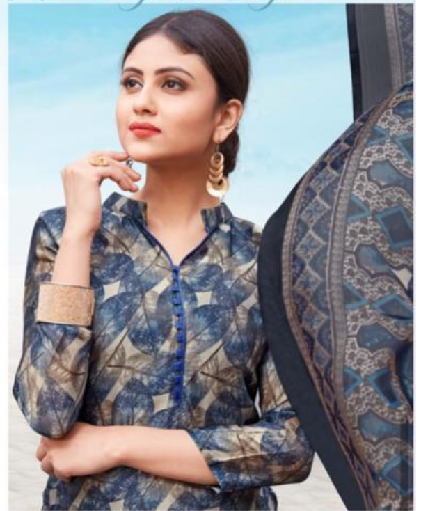
Embroider your vision with the latest collection of dresses with fine detailing D.NO-2008