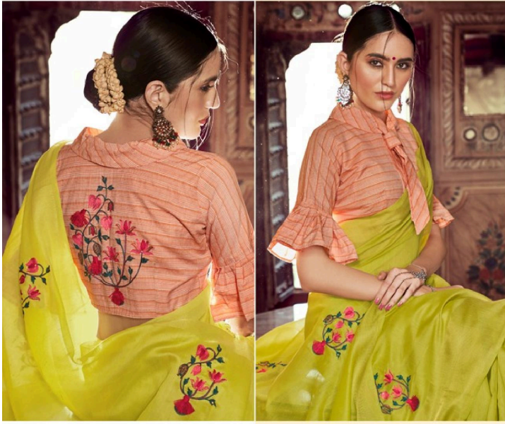
D. NO. - 3934