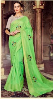
D.NO. - 3931