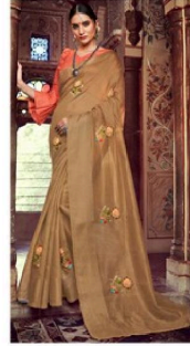
D.NO. - 3938