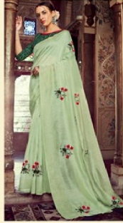
D.NO. - 3937