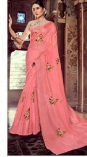
D.NO. - 3940