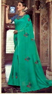
D.NO. - 3935