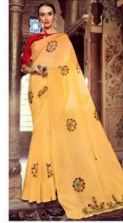
D.NO. - 3939