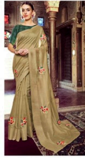
D.NO. - 3933