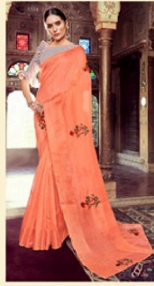
D.NO. - 3932