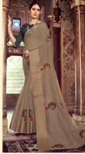
D.NO. - 3936