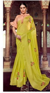
D.NO. - 3934