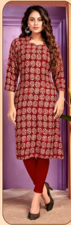
❖ 1009 ❖