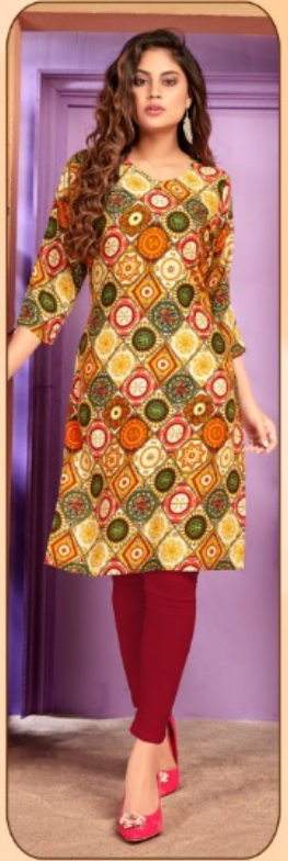
❖ 1005 ❖