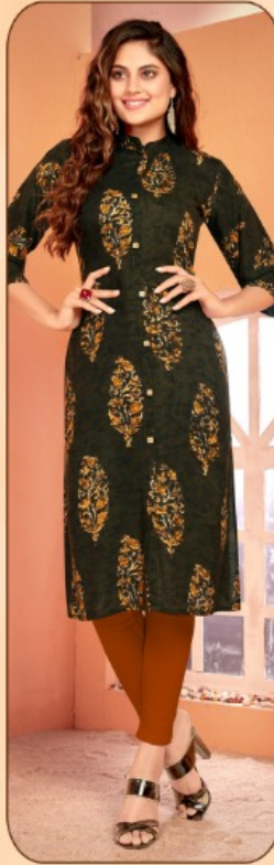
❖ 1004 ❖