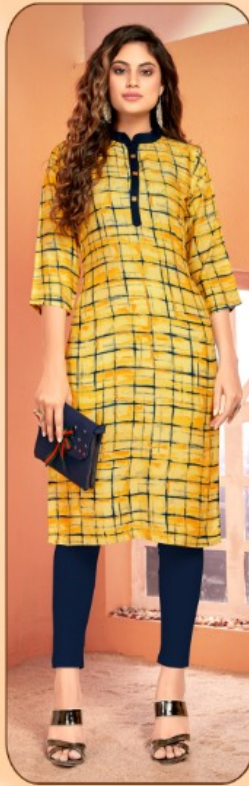
❖ 1007 ❖