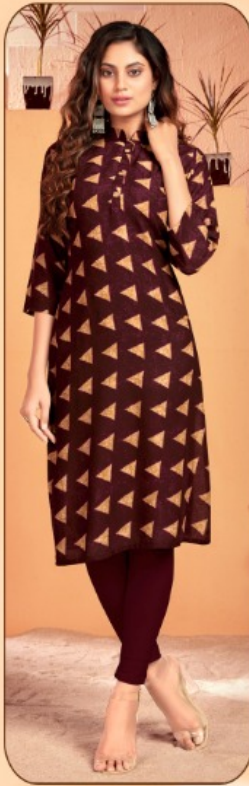
❖ 1006 ❖