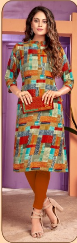
❖ 1003 ❖