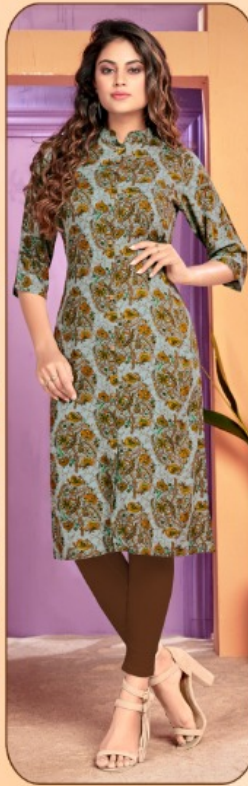
❖ 1008 ❖