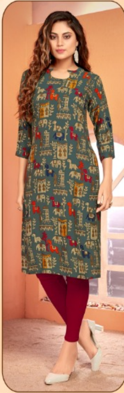
❖ 1002 ❖