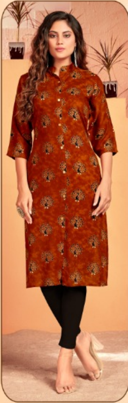
❖ 1001 ❖