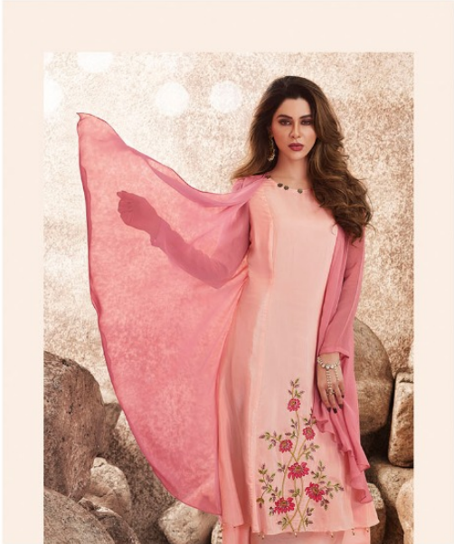
309 CONFORMING TO GOOD TASTE