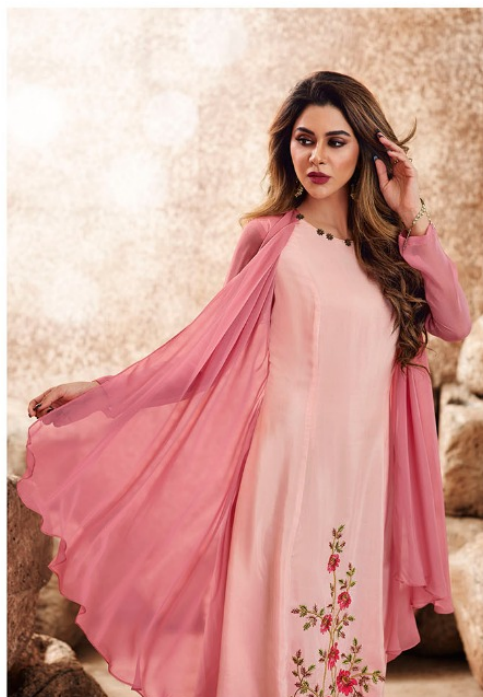
The contemporary design for the fashion conscious woman while preserving the traditional art and culture of India.