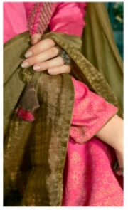
While it's nice to appreciate the fashion world, what makes you happy are real relationships and the moments you share with loved ones.