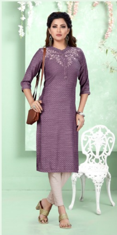
2502 - MAUVE