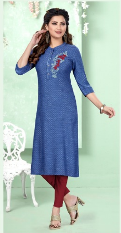
2503 - ROYAL BLUE