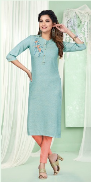
2499 - AQUA