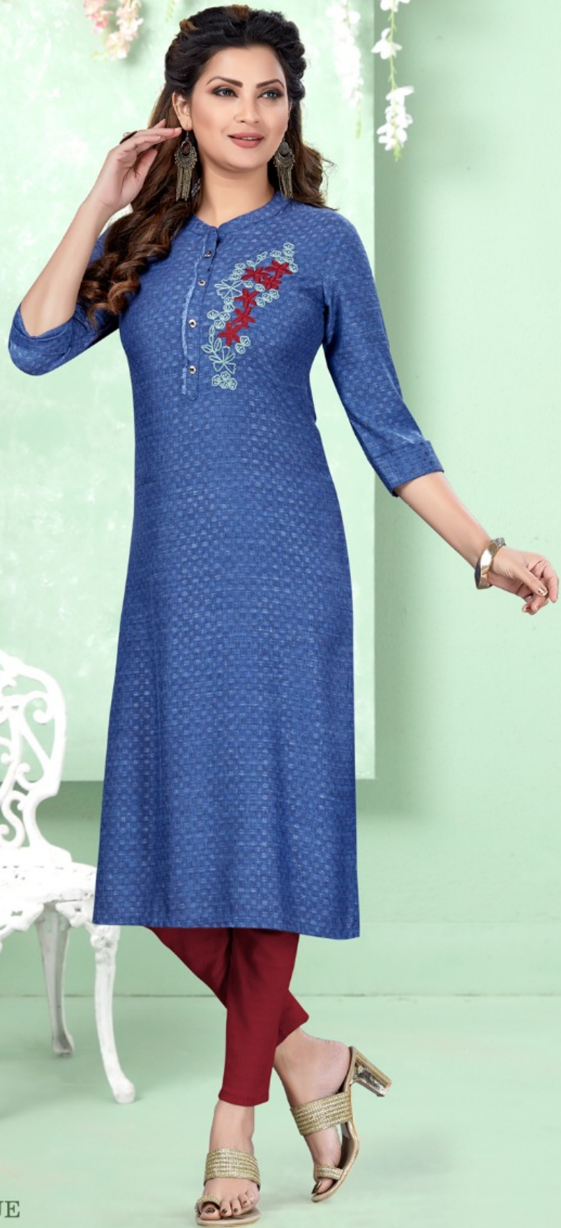
2503 - ROYAL BLUE