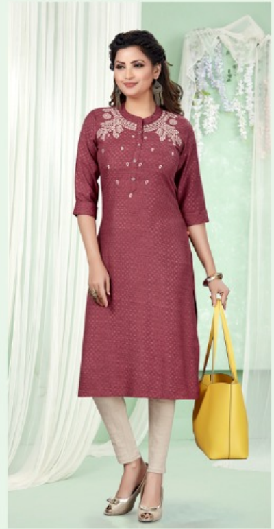
2500 - MAROON