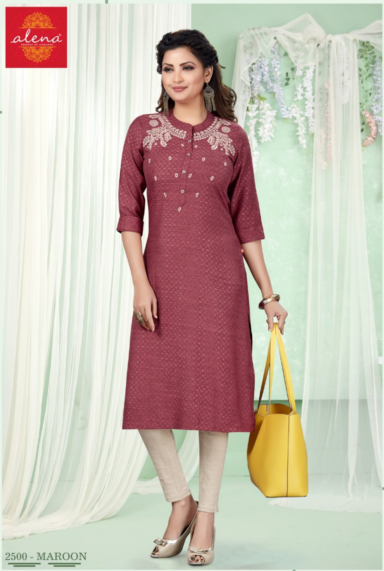
2500 - MAROON