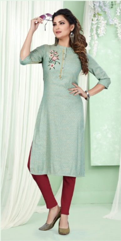
2498 - EMERALD