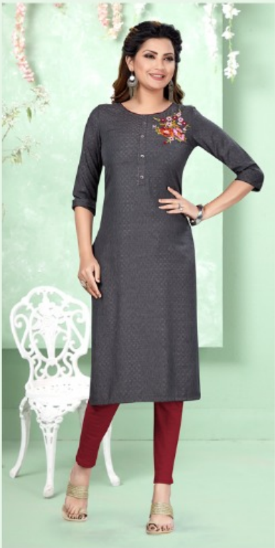
2501 - BLACK