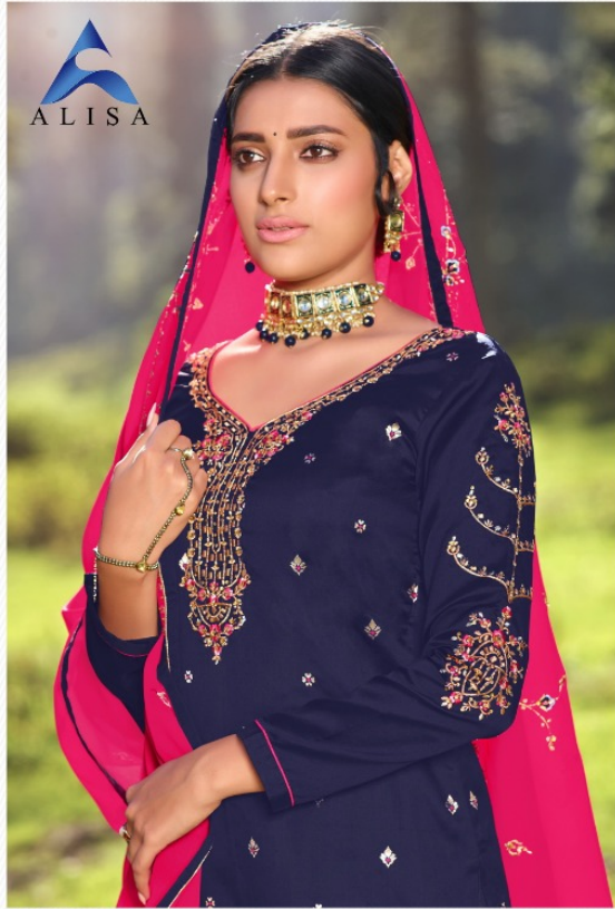
LET YOUR ATTIRE SPEAK FOR YOUR TRADITION