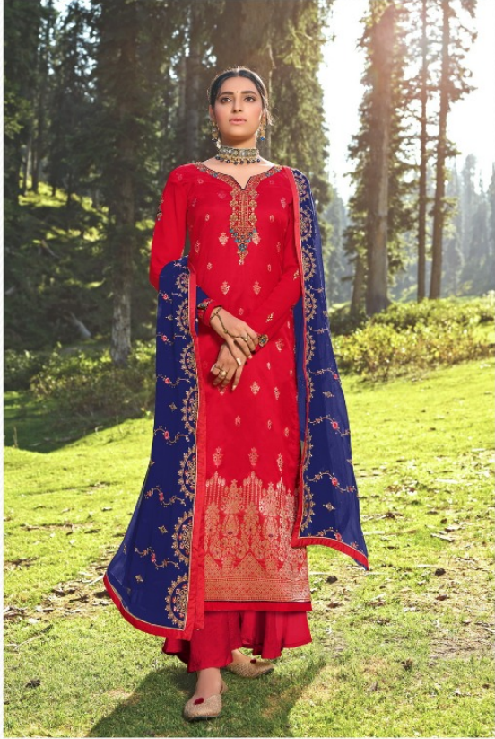
DEFINE CLASS WITH ELEGANT, SOPHISTICATED, YET LAVISH DRAPES