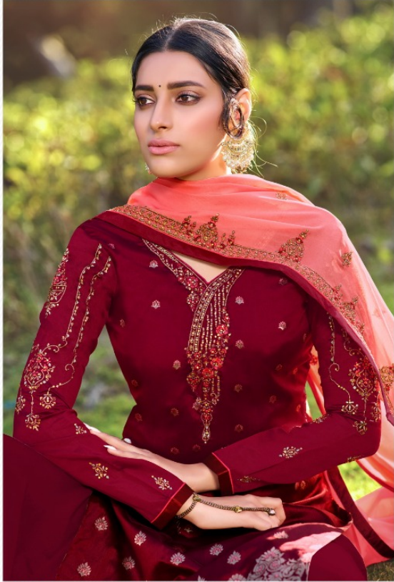
FEEL ABSOLUTELY GORGEOUS WHILE DRAPING YOURSELF IN SUIT