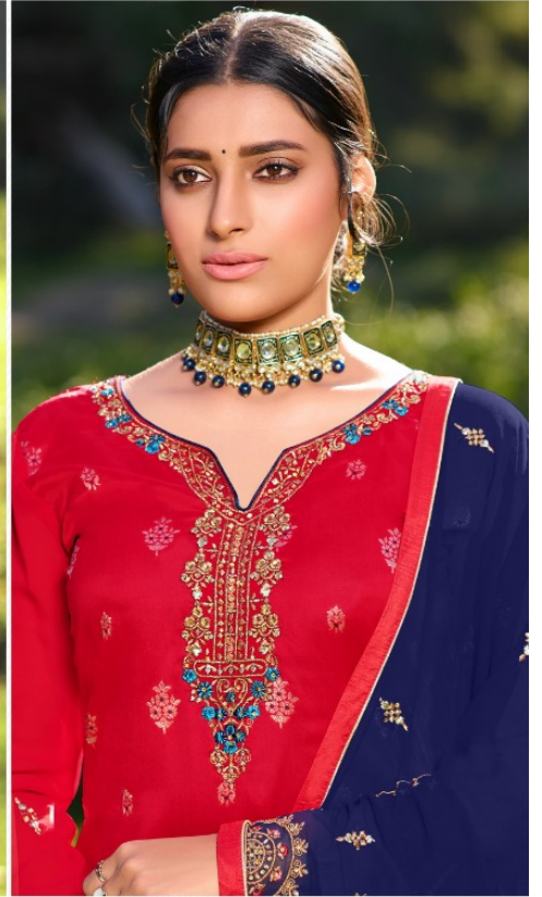
DEFINE CLASS WITH ELEGANT, SOPHISTICATED YET LAVISH DRAPES.