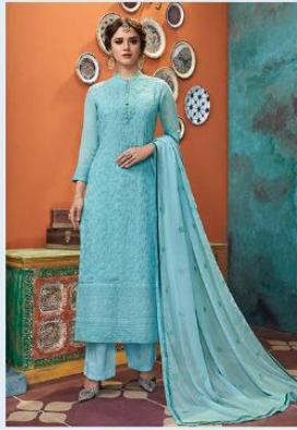
| 2001 |