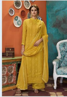
| 2001 |