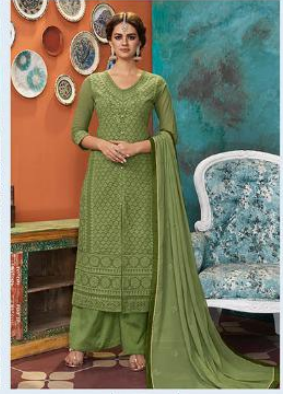
| 2001 |