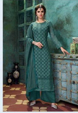
| 2001 |