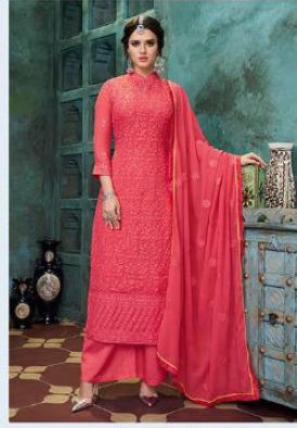
| 2001 |