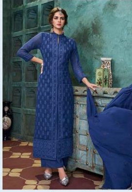
| 2001 |