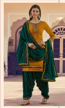
D.No :- 5615