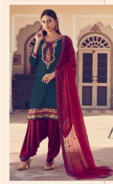
D.No :- 5616