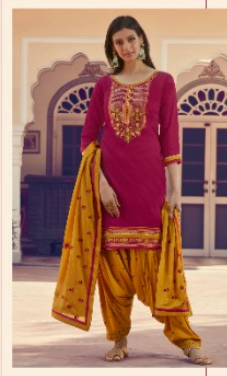
D.No :- 5611