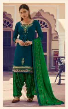
D.No :- 5618