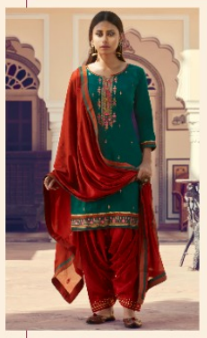
D.No :- 5612