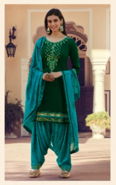
D.No :- 5614