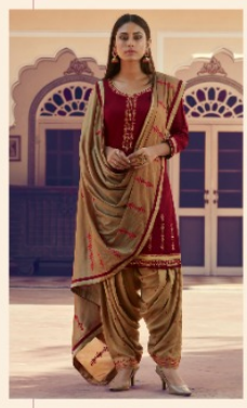
D.No :- 5613