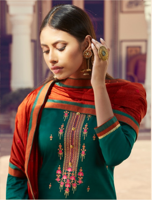
Immerse yourself in unexpected bright colors and textures.