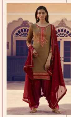
D.No :- 5617