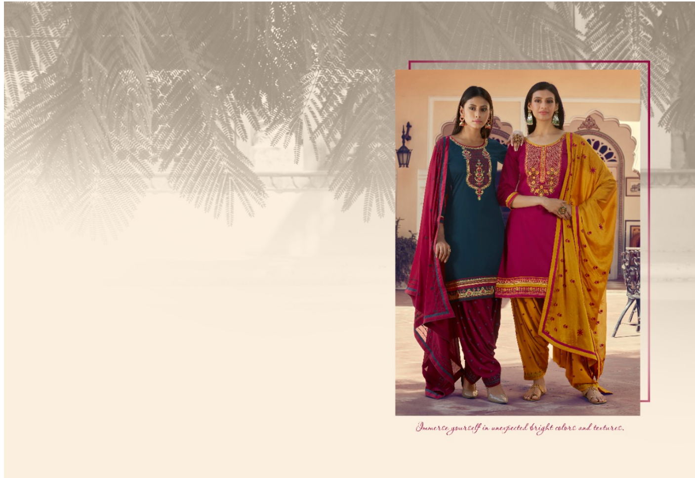
Immerse yourself in unexpected bright colors and textures.