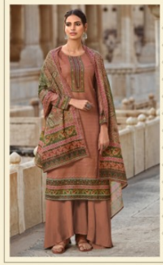
◆ 503 ◆