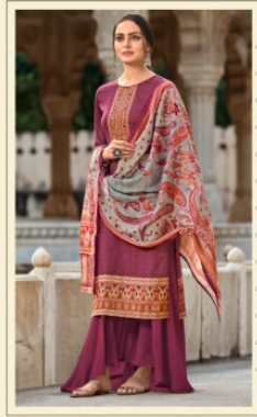
◆ 507 ◆