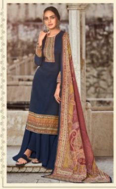
◆ 502 ◆