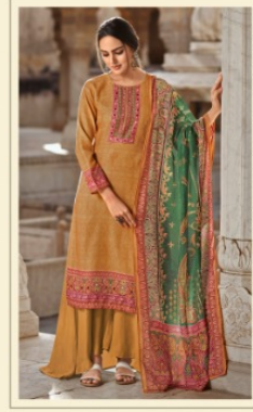
◆ 504 ◆