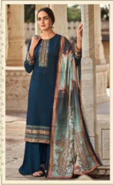
◆ 505 ◆