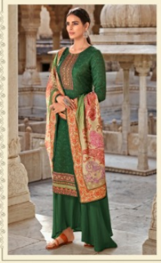
◆ 501 ◆