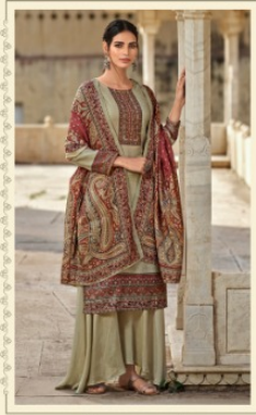
◆ 506 ◆