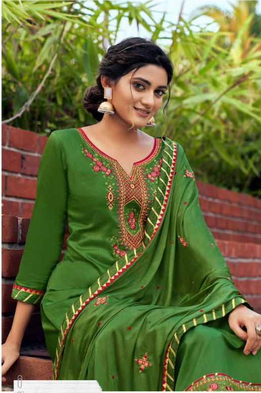
Beauty is just a word, until observed. 342 Classic styles with luxurious and fabrics are highlighted by vibrant and intricate details.