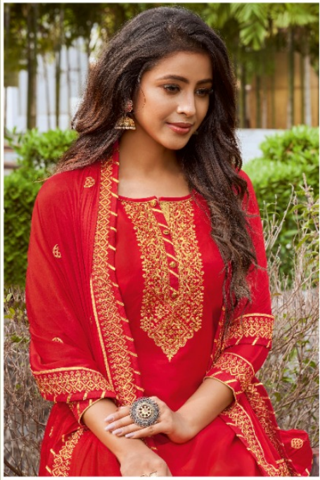
a blend of colors that highlight every corner of the attractive designs that in turn adorn you with vast beauty 321