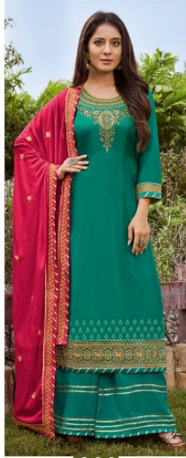
3 2 3