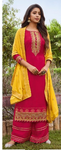
3 2 4