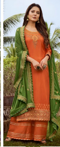
3 2 6