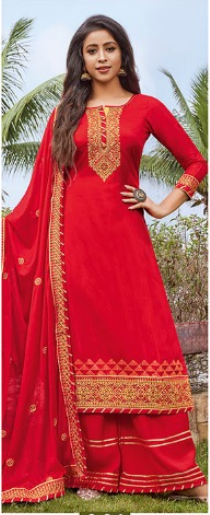
3 2 1