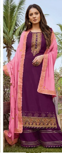
3 2 5