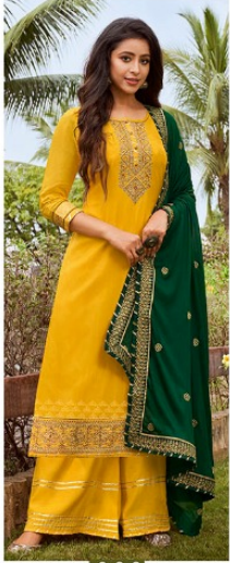
3 2 2