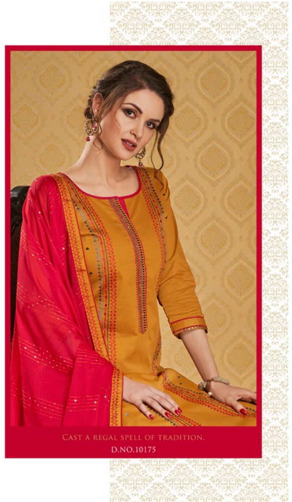
CAST A REGAL SPELL OF TRADITION. D.NO.10175