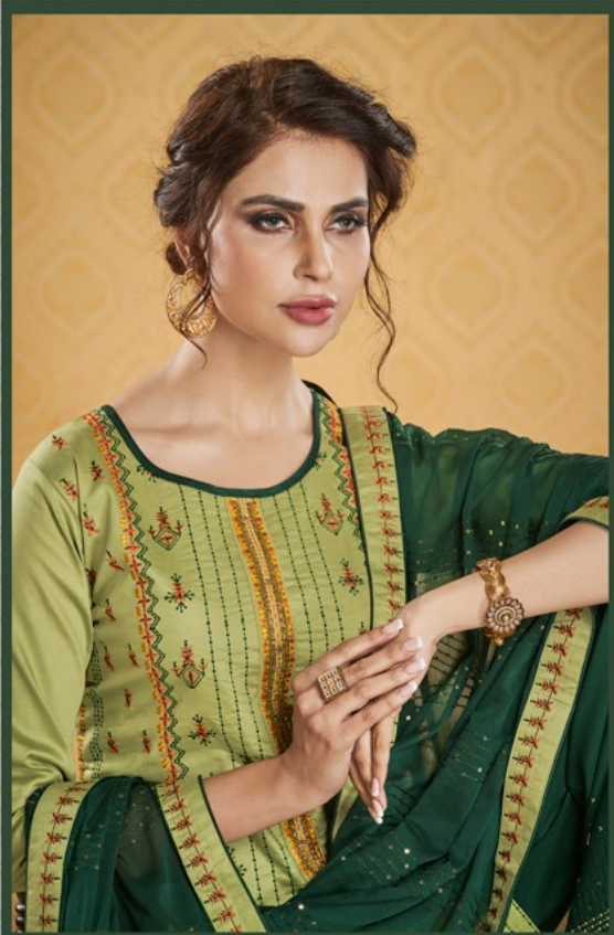
CAST A REGAL SPELL OF TRADITION. D.NO.10171