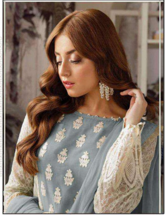
Top - Georgette heavy embroidered Inner Bottom - Santoon silk with patch Dupatta - Nazneen heavy embroidered