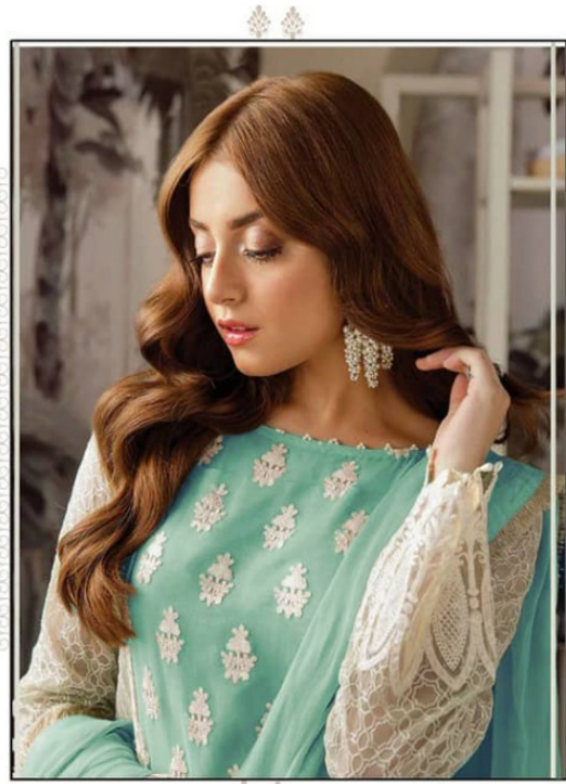
Top - Georgette heavy embroidered Inner Bottom - Santoon silk with patch Dupatta - Nazneen heavy embroidered