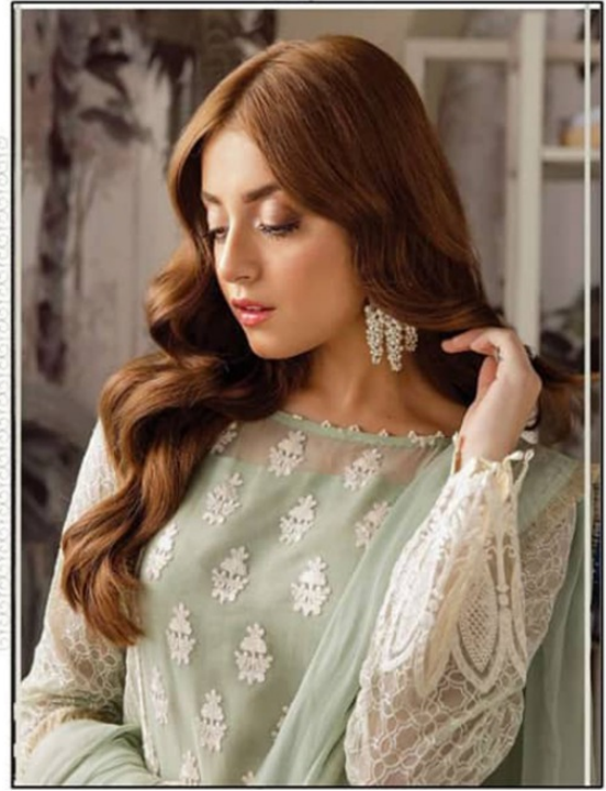
Top - Georgette heavy embroidered Inner Bottom - Santoon silk with patch Dupatta - Nazneen heavy embroidered