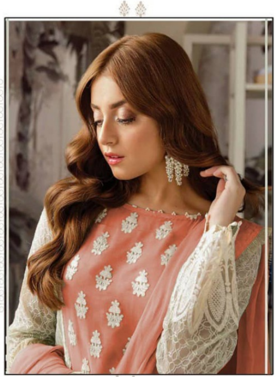
Top - Georgette heavy embroidered Inner Bottom - Santoon silk with patch Dupatta - Nazneen heavy embroidered