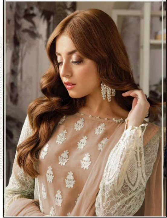
Top - Georgette heavy embroidered Inner Bottom - Santoon silk with patch Dupatta - Nazneen heavy embroidered