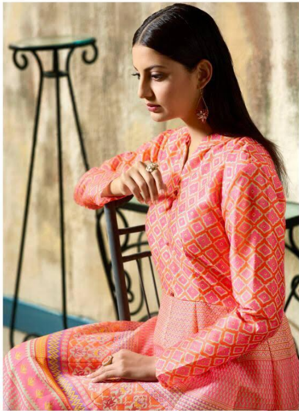
This season, we bring a new dimension to Indian as it excels in innovation and country 103