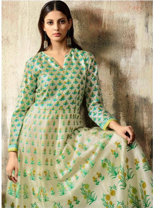
A perfect blend of traditional ethnic designs, techniques & colors with collection had something for everyone