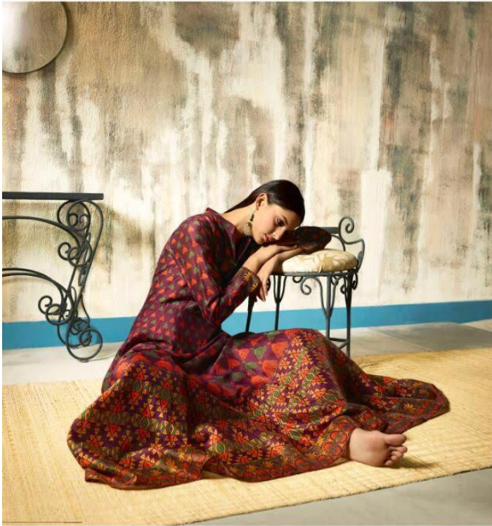
Dirce 101 DR I always find beauty in things that are old and imperfect these are much more interesting which I believe is my fashion