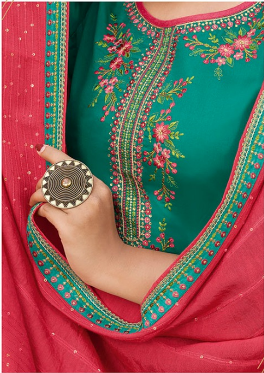
SIMPLE WITHOUT letting so of elegance & TRADITION WITH NATURAL FABRICS 5658