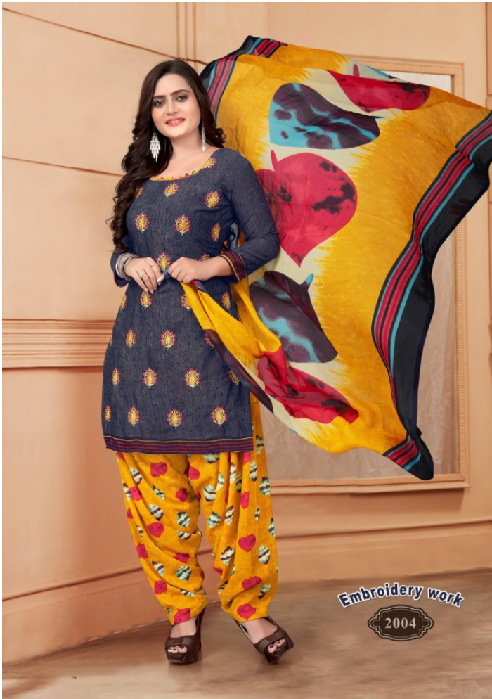
Embroidery work 2004

COMFORT STOP BY FOR A LOOK AT OUR COMFORTABLE DRAPES AND DELICATE EMBELLISHMENTS