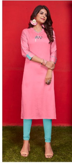
..... 53 .....