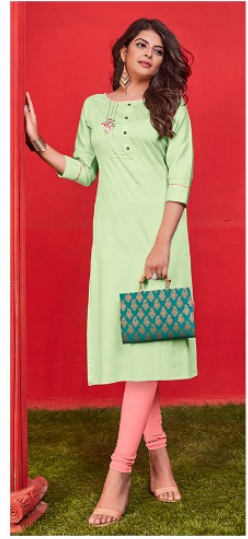
..... 54 .....