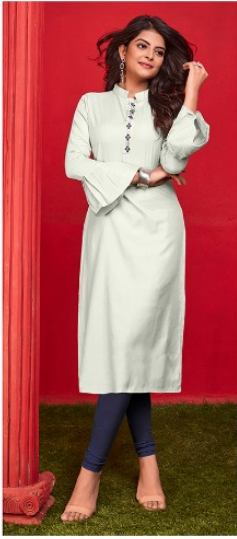
..... 51 .....