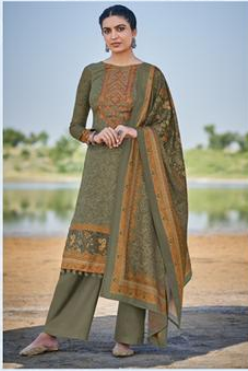
Malhar | 2001