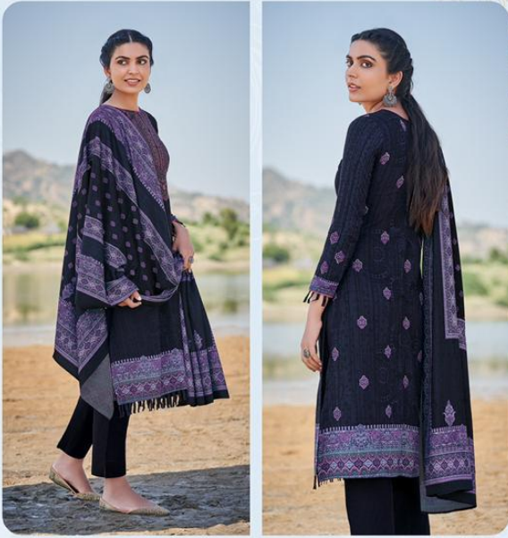
Malhar | 2006