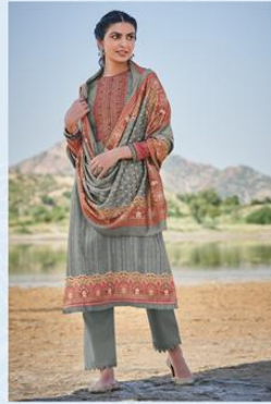
Malhar | 2005