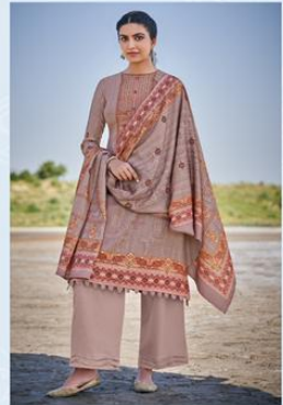
Malhar | 2008