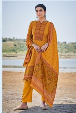
Malhar | 2007