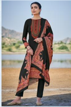
Malhar | 2002