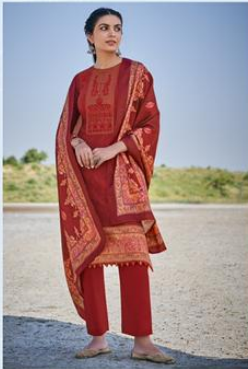
Malhar | 2003