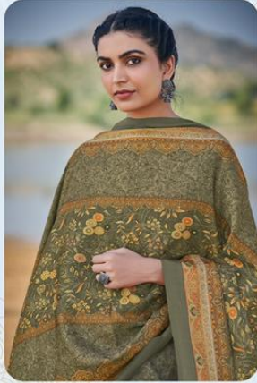
Malhar | 2001