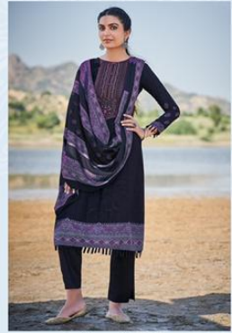
Malhar | 2006