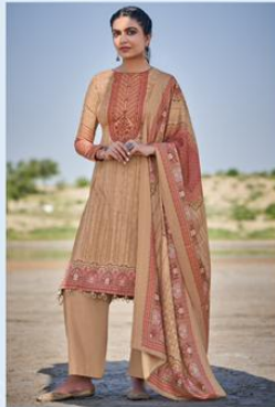
Malhar | 2004