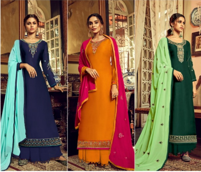
d.no : 6301