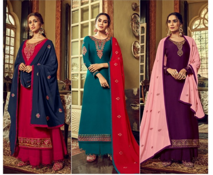
d.no : 6304