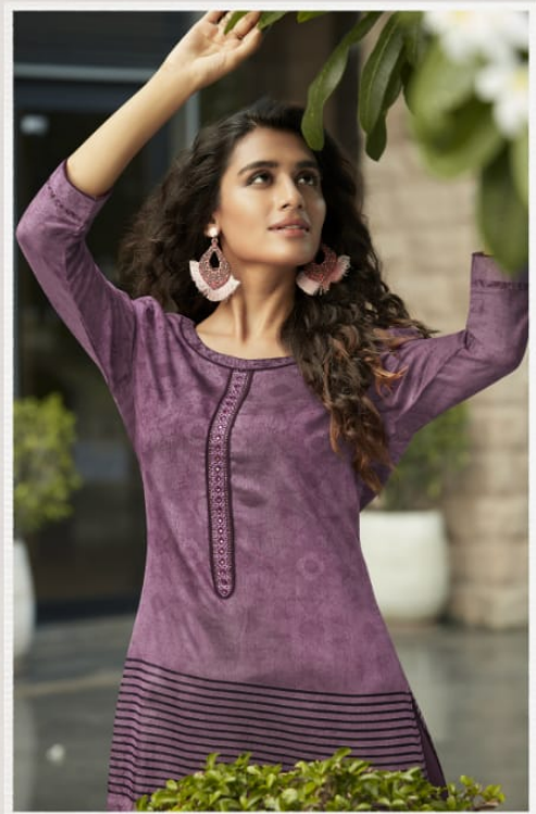
Clara Shine Fashion and style always depend on good color and fabrics combination of them D.NO. 12101