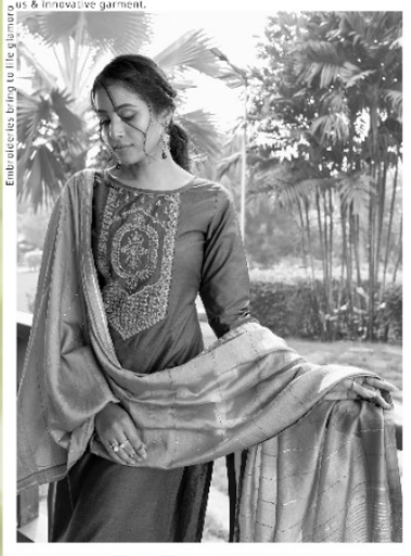
Embellishes bring to life glamorous & innovative garment.