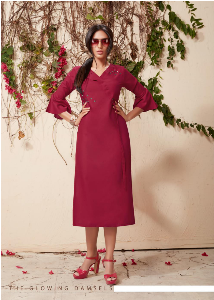
THE GLOWING DAMSELS