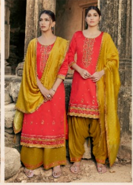
D.No :- 5756