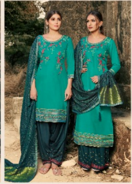
D.No :- 5758