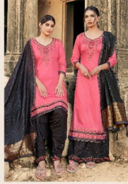
D.No :- 5755