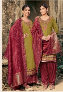
D.No :- 5757