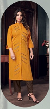
DESIGN NO : - 2821