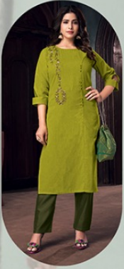
DESIGN NO : - 2824