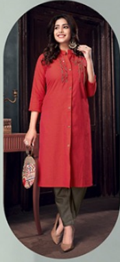
DESIGN NO : - 2825