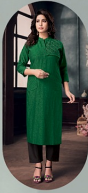
DESIGN NO : - 2822