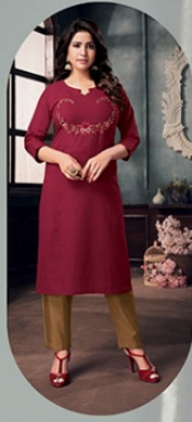
DESIGN NO : - 2823