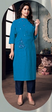
DESIGN NO : - 2826