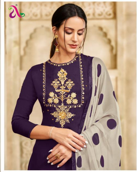
9007 | elavate your lok with the fabulous colors