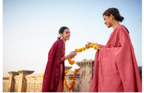
Inspired by India while adding an edge of a cheerful, contemporary style