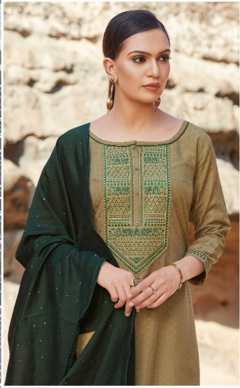
D No :- 2764