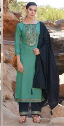
D No :- 2763