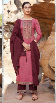
D No :- 2766