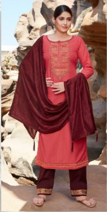
D No :- 2761