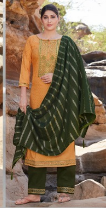
D No :- 2765