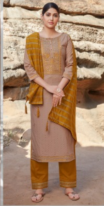
D No :- 2762