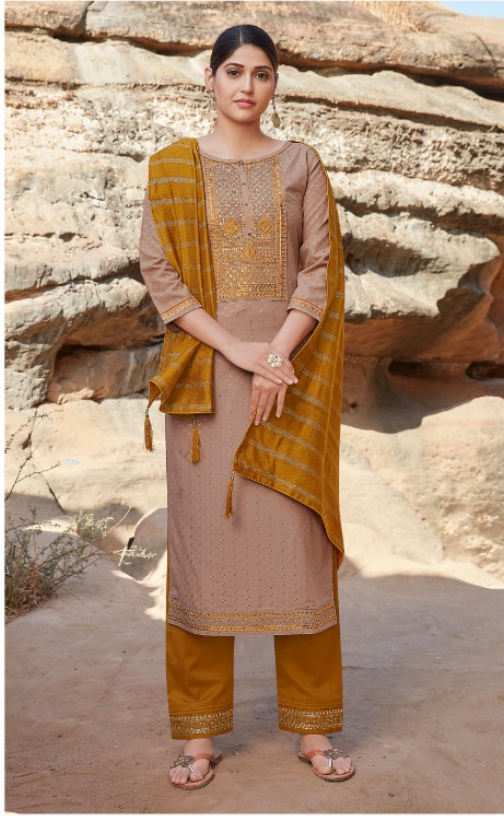
D No :- 2762