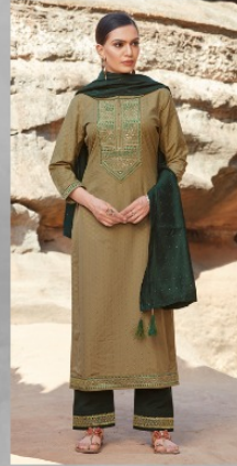
D No :- 2764