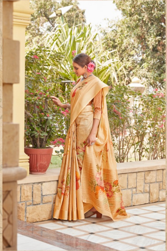
❖ Flerella-305 ❖