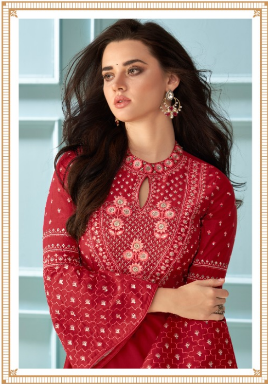
A blend of colors that highlight every corner of the attractive designs that in turn adorn you with vast beauty