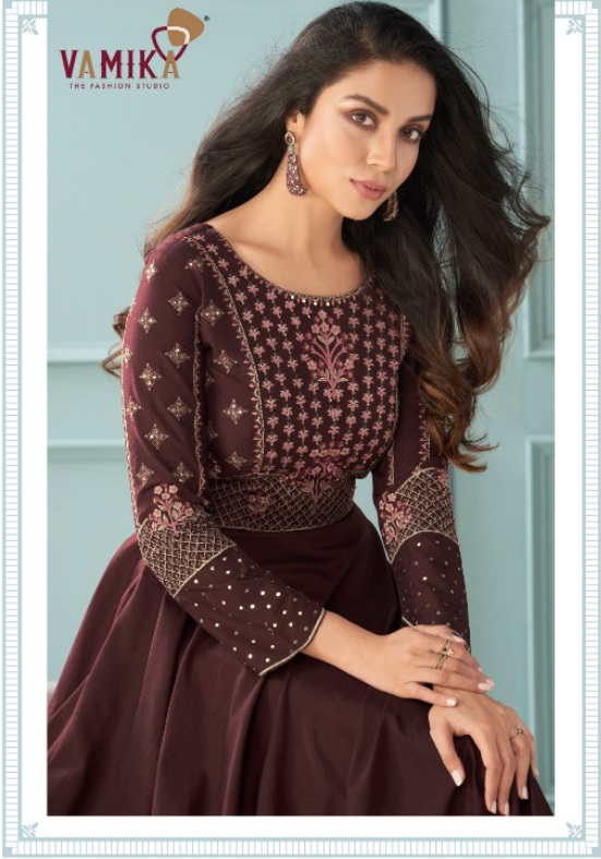
Earthy tones & natural fabrics make for soft classic Look to your beauty ..... 22030