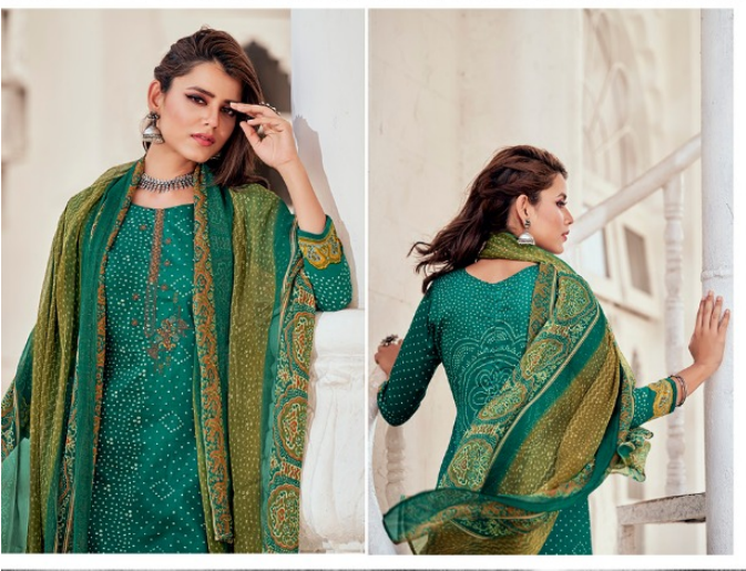
ELEGANCE & SOPHISTICATED CREATE A CHARMING SYMPHONY 154