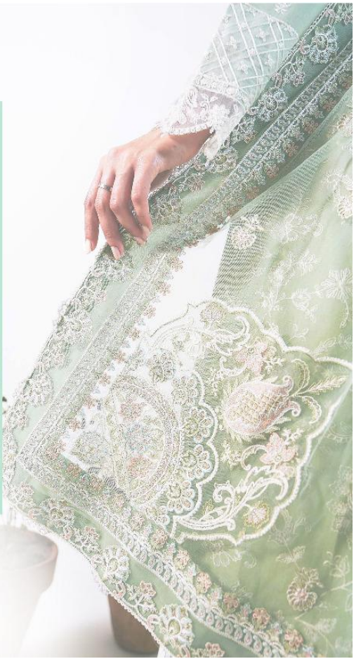
ZARA SHEHZAN LAWN COLLECTION