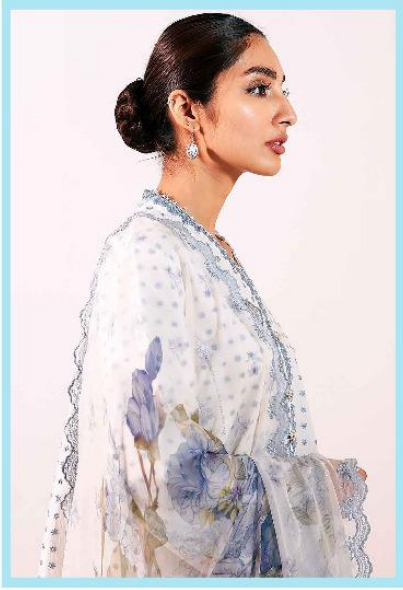
ZARA SHEHZAN LAWN COLLECTION