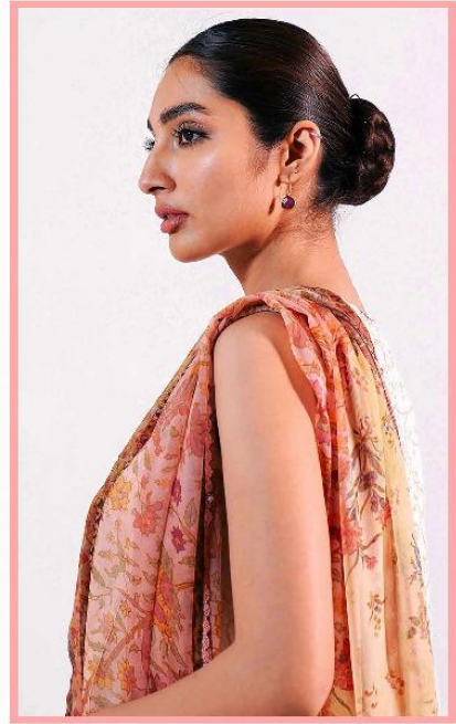
ZARA SHEHZAN LAWN COLLECTION