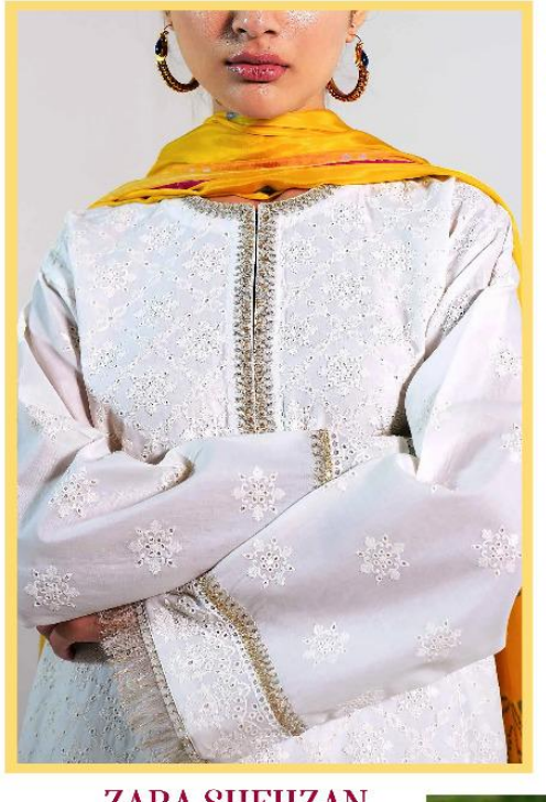
ZARA SHEHZAN LAWN COLLECTION