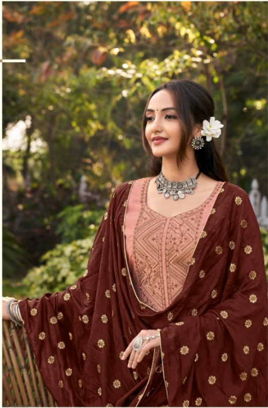
Fresh look to see change all the shades for enhance your beauty.