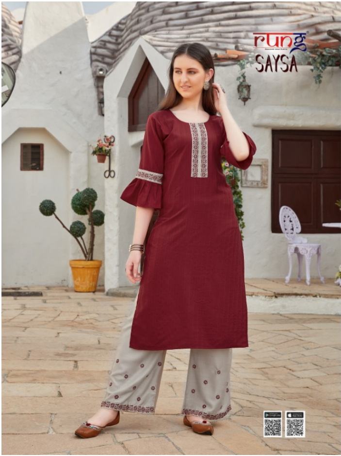
The Empress of glamour