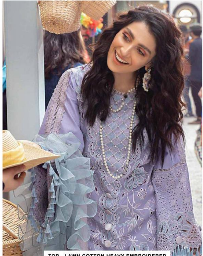
TOP - LAWN COTTON HEAVY EMBROIDERED BOTTOM - PC COTTON DUPATTA - CHIFFON DIGITAL PRINTED