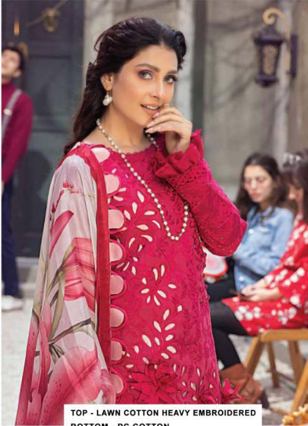
TOP - LAWN COTTON HEAVY EMBROIDERED BOTTOM - PC COTTON DUPATTA - CHIFFON DIGITAL PRINTED