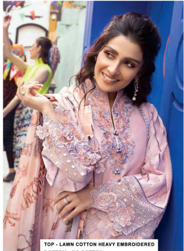
TOP - LAWN COTTON HEAVY EMBROIDERED BOTTOM - PC COTTON DUPATTA - CHIFFON DIGITAL PRINTED