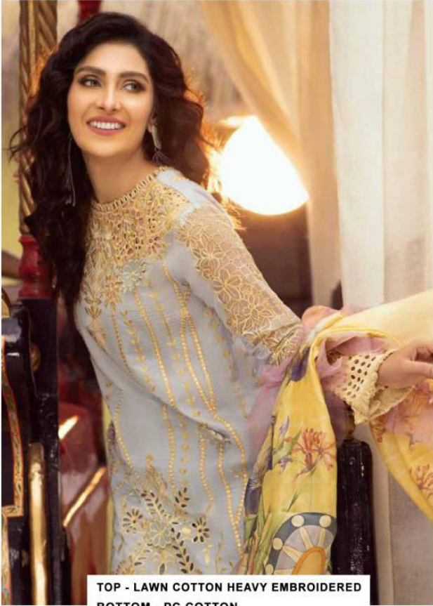
TOP - LAWN COTTON HEAVY EMBROIDERED BOTTOM - PC COTTON DUPATTA - CHIFFON DIGITAL PRINTED