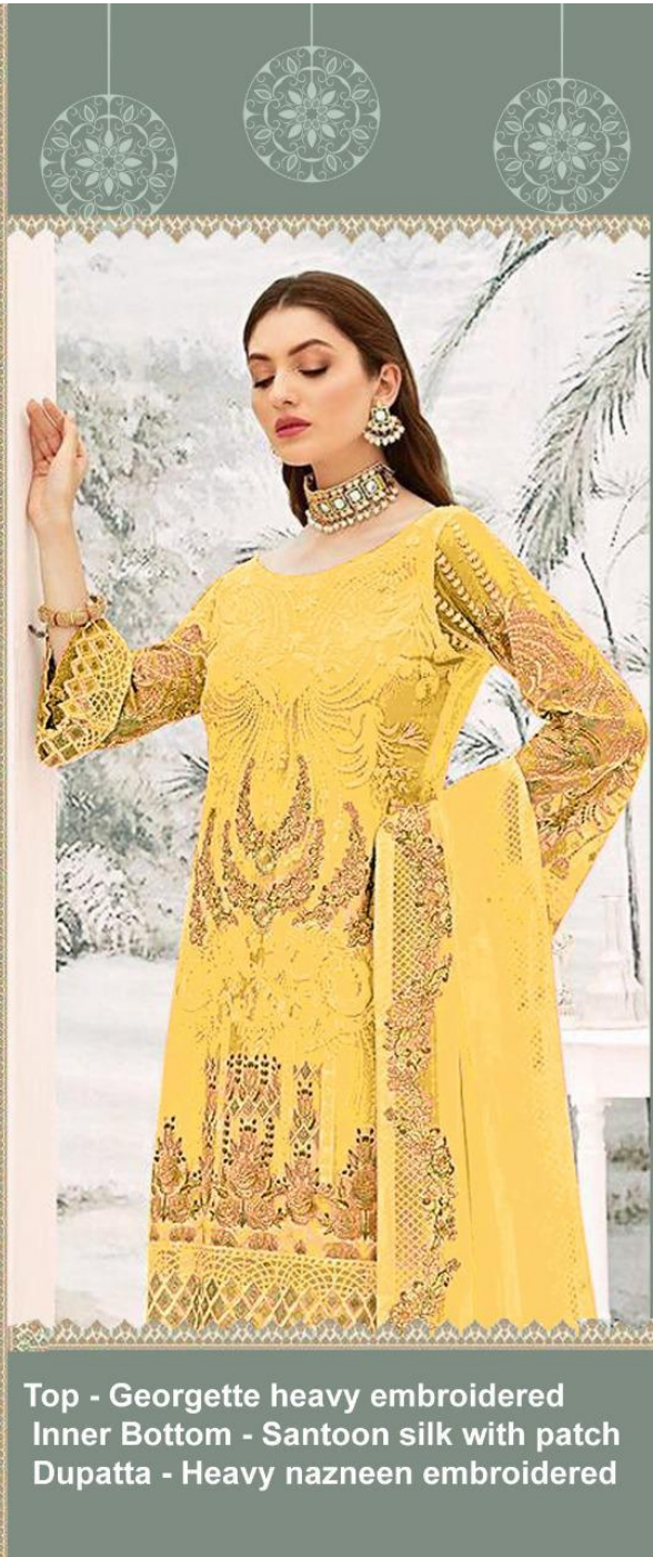
Top - Georgette heavy embroidered Inner Bottom - Santoon silk with patch Dupatta - Heavy nazneen embroidered