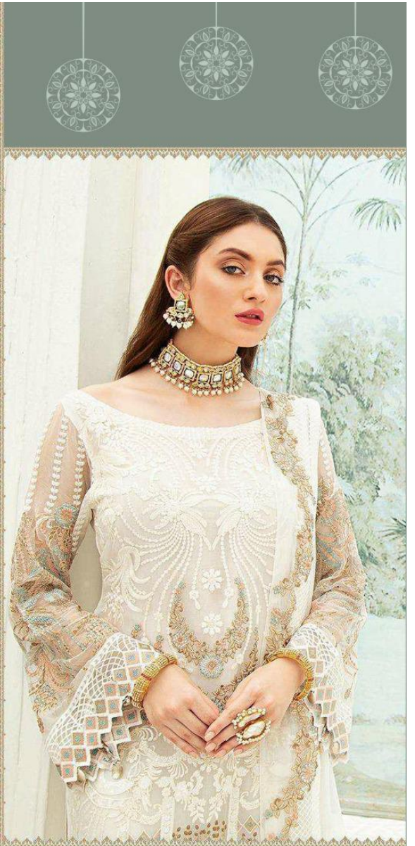
Top - Georgette heavy embroidered Inner Bottom - Santoon silk with patch Dupatta - Heavy nazneen embroidered