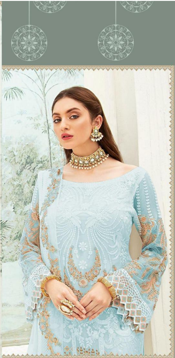
Top - Georgette heavy embroidered Inner Bottom - Santoon silk with patch Dupatta - Heavy nazneen embroidered