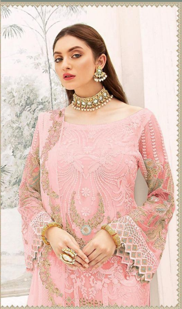
Top - Georgette heavy embroidered Inner Bottom - Santoon silk with patch Dupatta - Heavy nazneen embroidered