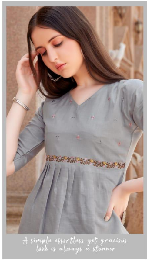
A simple effortless yet gracious look is always a stunner