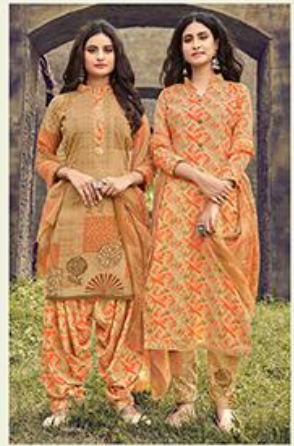
•• D.NO \ 1608