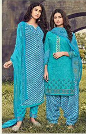
•• D.NO \ 1602