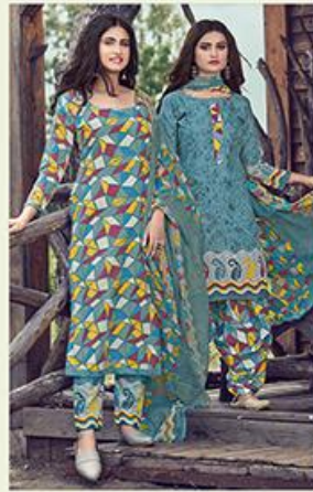
•• D.NO \ 1607