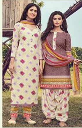
•• D.NO \ 1603