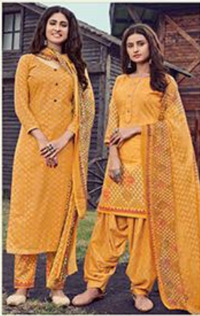
•• D.NO \ 1605