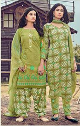
•• D.NO \ 1601