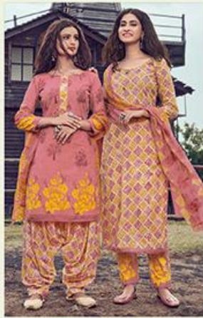
•• D.NO \ 1606