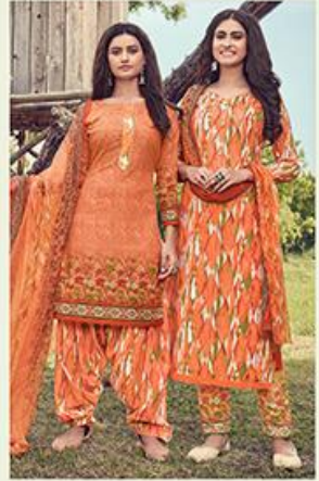
•• D.NO \ 1604