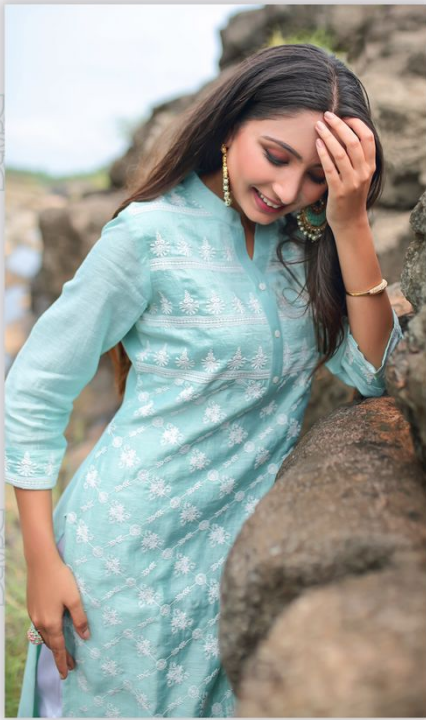
SHQV01 Sea Green - Dyed in a calming hue with embroidery, perfect for everyday wear.