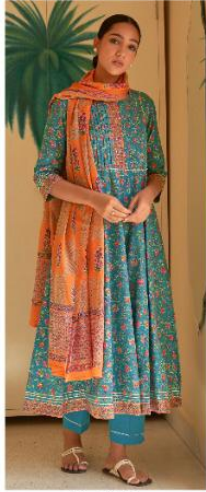
K - 203