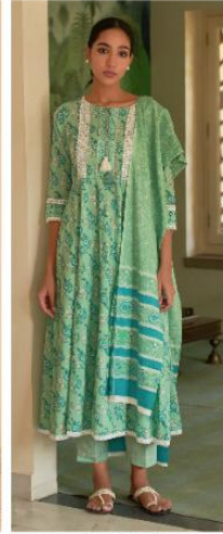
K - 205