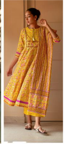
K - 206