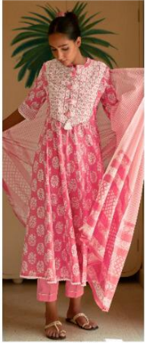
K - 202