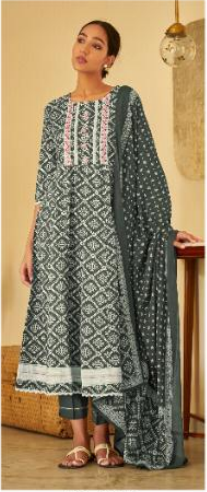
K - 201