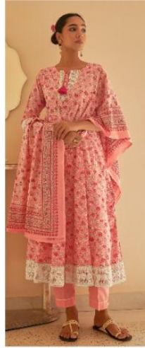
K - 204