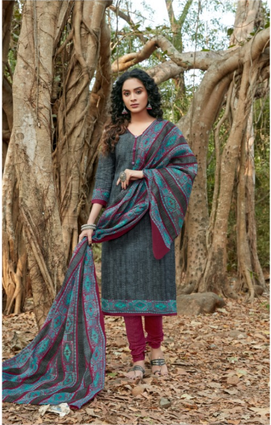
make everyday fashionable everything you need for fabulous wardrobe a round up of the hottest this season D.No.6004