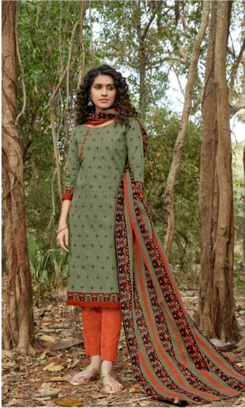
classic to temporary- the contemporary designs with classy colors giving luxurious touch with finished heavy look.