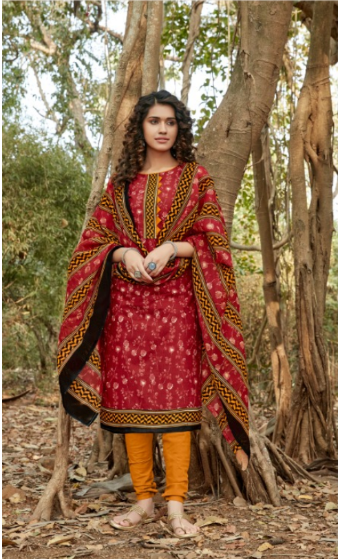
richly of beautifying-create a trend with this soothing color and fascinating attire to enhance your beauty... D.No.6012