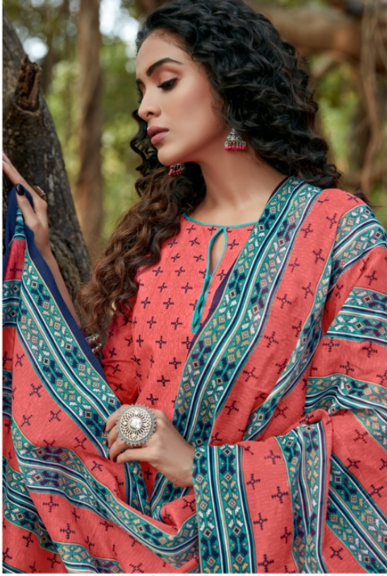
Classic outfits with a twist of interesting detailing, subtle sheen, rich texture is perfectly wrapped in panache giving style a new meaning and refresh your wardrobe to Indian culture. D.No.6011