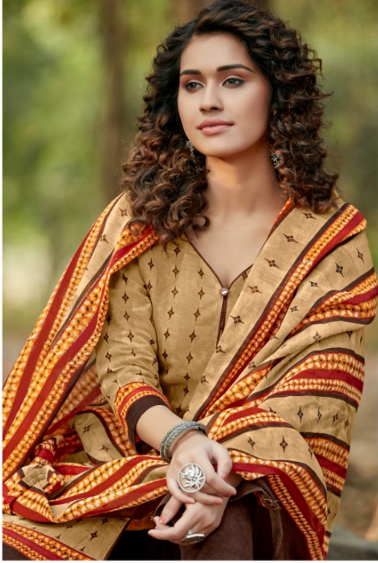
Beauty begins the moment you decide to be yourself. Style is reflection of your attitude & your personality. D.No.6008