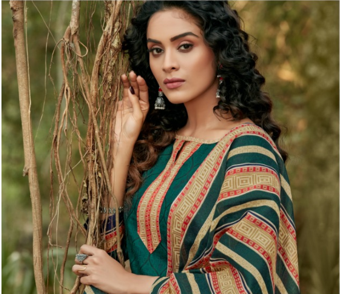
Elegance and style is always an integrated part of village attire, and when you adopt such style, you feel a sense of elegance and spirit of look. D.No.6006