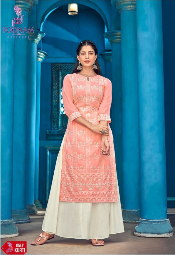
NO. _____ 201 Merge your STYLE with ELEGANCE