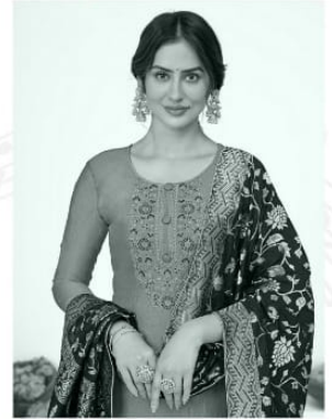
The flavor of subtle ethnic wear that meets the contemporary glam vividly explodes with minute detail's of Elegance.