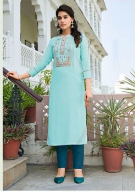
STYLE / 3222