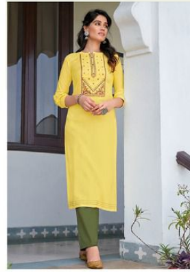
STYLE / 3227