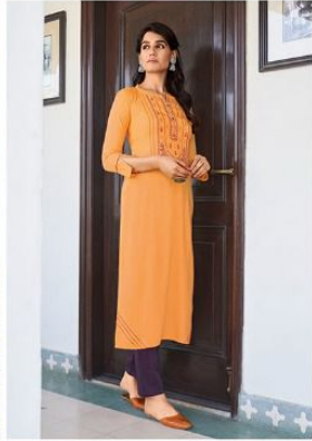
STYLE / 3224