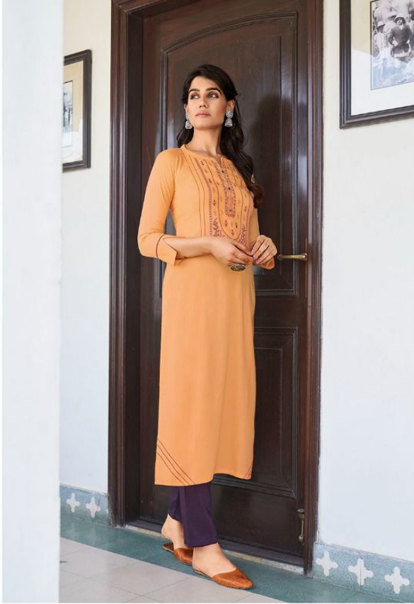
STYLE / 3224 ——— Dictate your style statement with the season's latest trends.