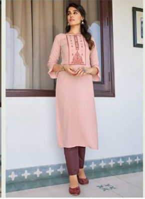
STYLE / 3226