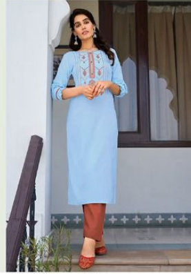
STYLE / 3225