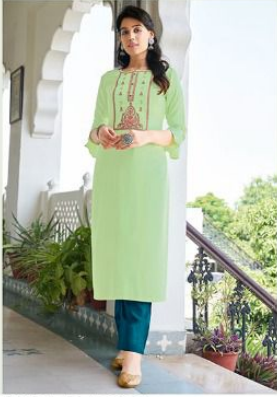
STYLE / 3221