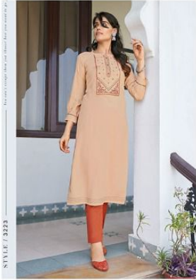
STYLE / 3223