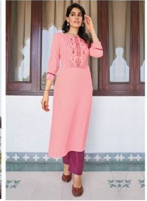
STYLE / 3228