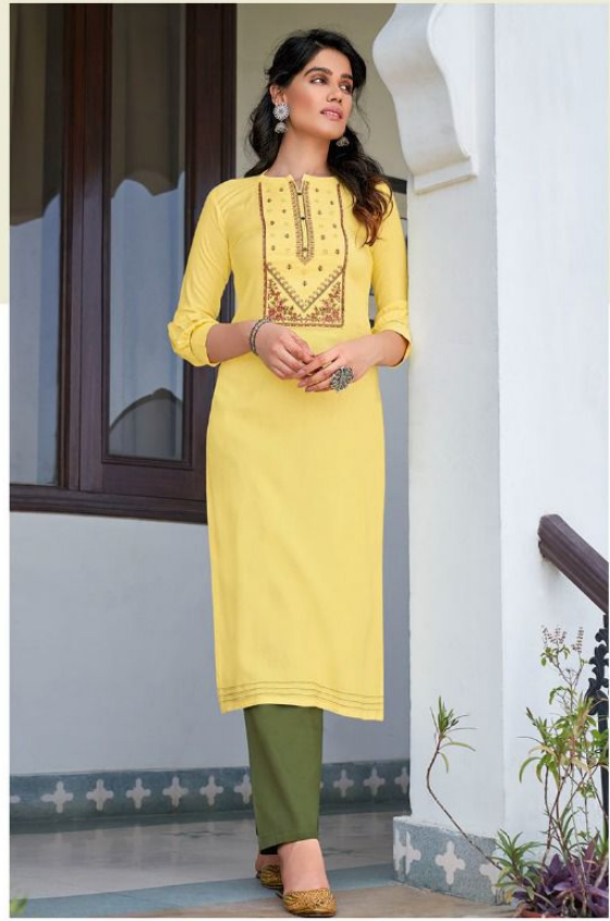
STYLE / 3227 — Rebel in a whole new level of elegance with a touch of exquisite sarees.