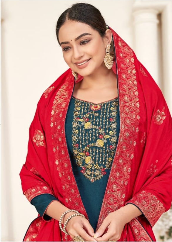
SEIZE ALL ATTENTION WITH THIS SPARKLING VIBRANT COLOR ATTRACTIVE DRESS WITH NATURAL FLOWER