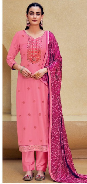
❖ 3303 ❖