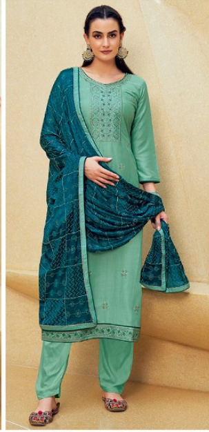
❖ 3302 ❖