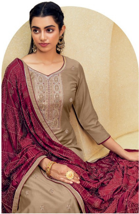
Immerse yourself in unexpected, bright colors & Textures