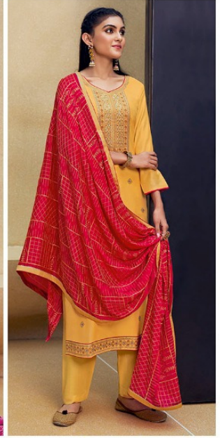
❖ 3304 ❖