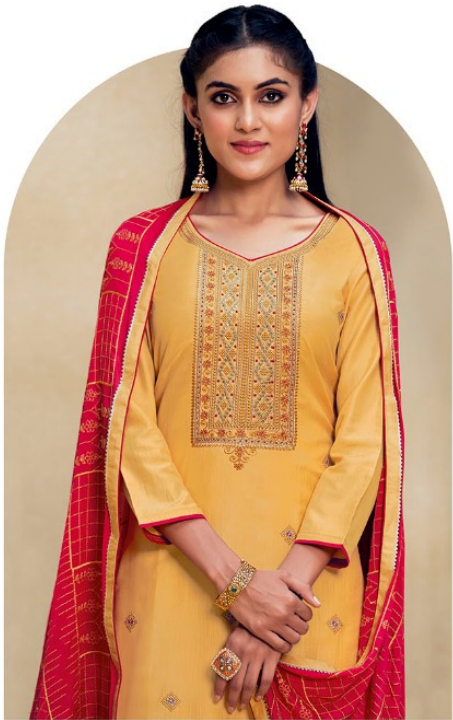
Immerse yourself in unexpected, bright colors & Textures