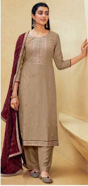
❖ 3301 ❖