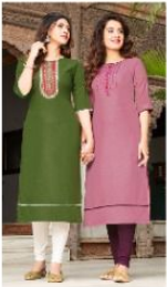
AR 46-AR 47