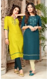
AR 40-AR 41