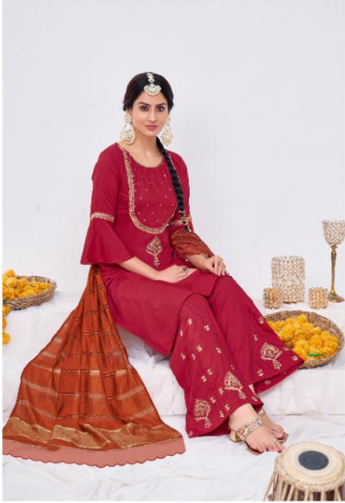
Earthy tones & natural fabric, made for soft classic look to beauty.