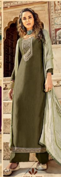
STYLE : 2905