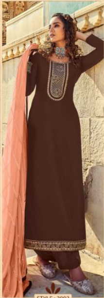
STYLE : 2903