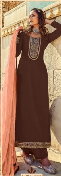
STYLE : 2903