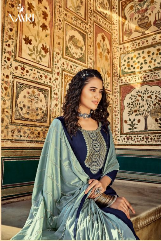
STYLE : 2901