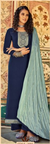
STYLE : 2901