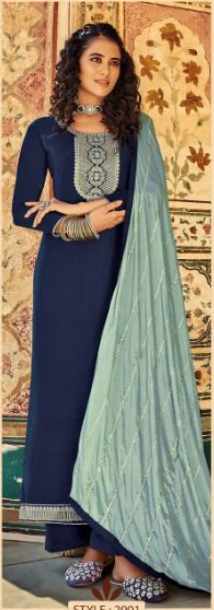
STYLE : 2901