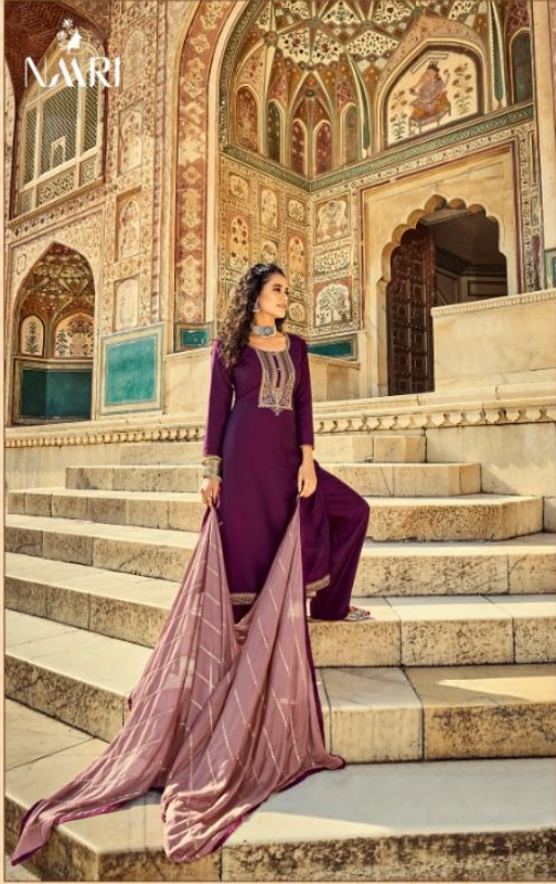
STYLE : 2904