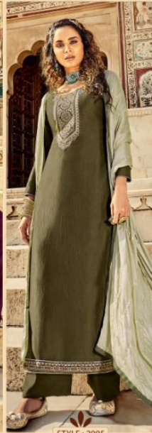
STYLE : 2905