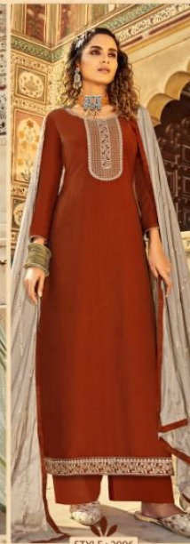
STYLE : 2906