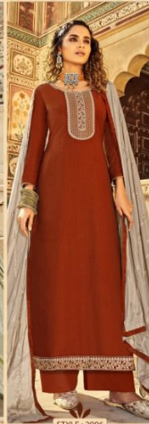
STYLE : 2906