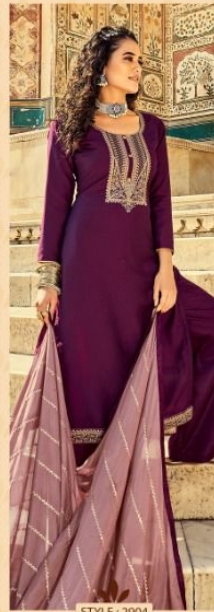
STYLE : 2904