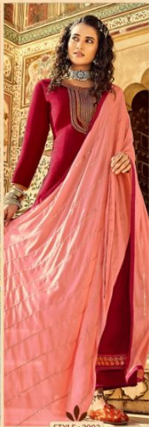
STYLE : 2902