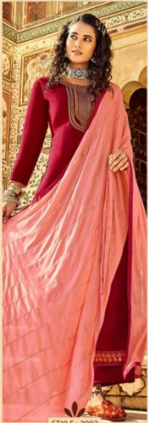
STYLE : 2902